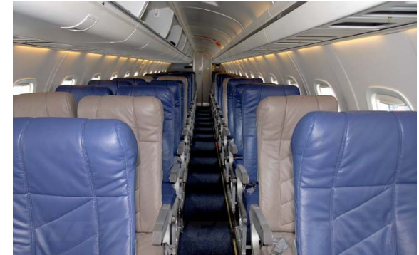
Sample ExpressJet Interior